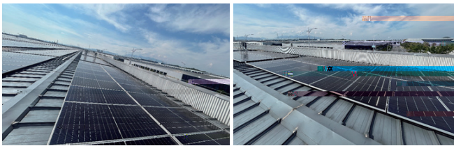
: Project Picture

BC modules are assumed to be ideal for rooftop installation because of their higher front-side power relative to TOPCon module. Meanwhile, the bifaciality disadvantage of BC cells can be minimized in rooftop scenarios. Therefore, this study compared the performance of TOPCon PV modules and BC modules to determine their energy yield in real-world conditions and their potential for rooftop applications.